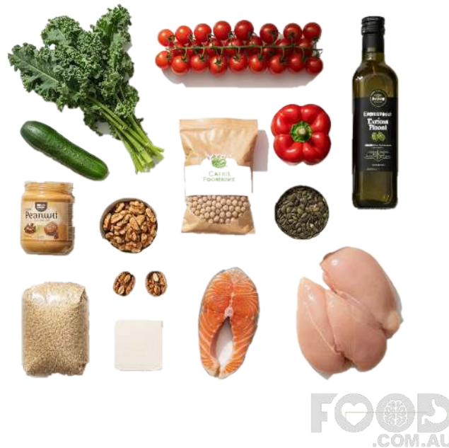
Your Bowl Method starter pantry.

You do not need expensive ingredients to eat well. A well-stocked pantry built around Bowl Method staples means that even on a rushed weeknight, a nutritious meal is always within reach.