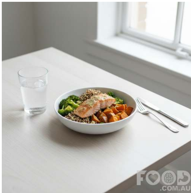
Healthy eating, beautifully simple.

This guide walks you through each step of the framework, shows you how to build your first bowl, and gives you six ready-to-go recipes to get started. Whether you are cooking for one or feeding the whole family, The Bowl Method works with any cuisine, any budget, and any lifestyle.